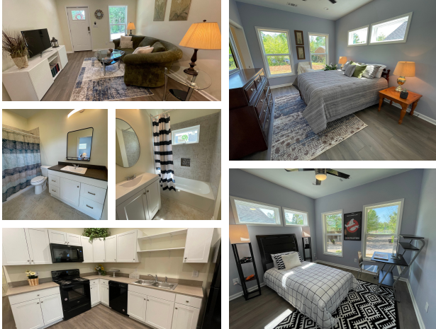
Inside an NCHF home