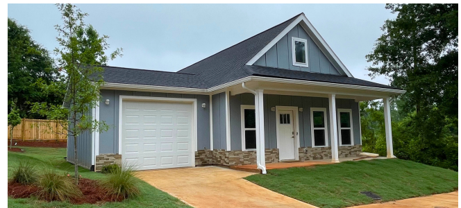
East Broad Estates, Newnan, GA